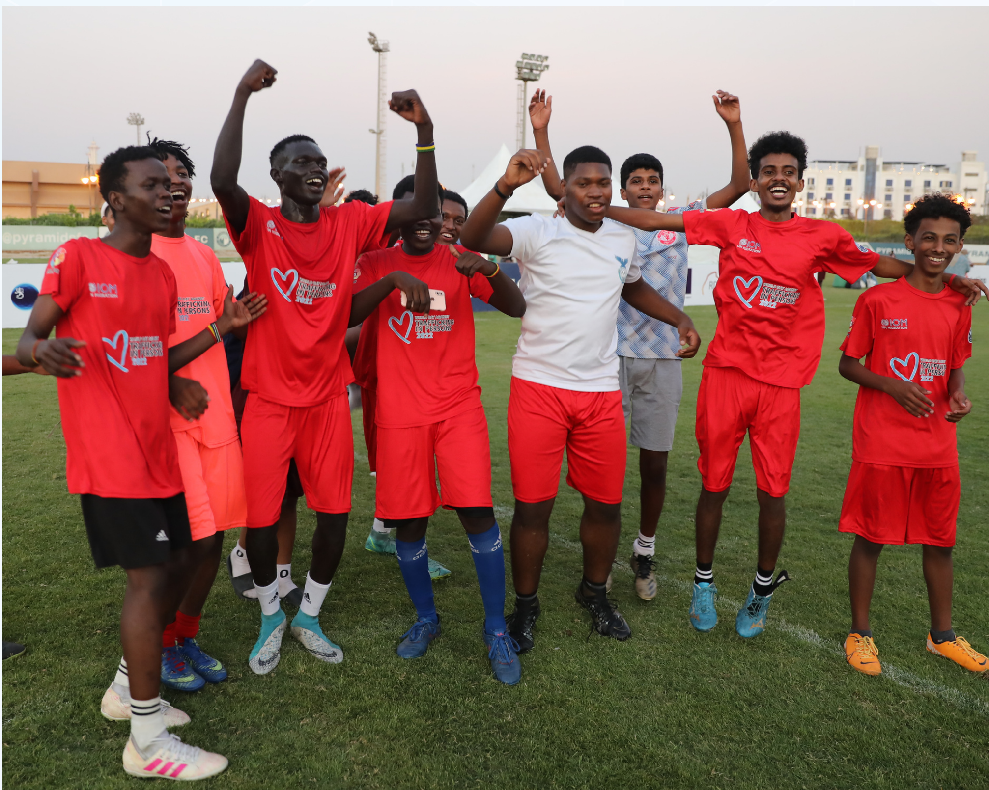
The World Day Against Trafficking in Persons 2022

By supporting and empowering the youth of today, we tap into their unlimited potential and build a brighter future for us all.